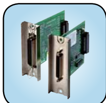
Plug-In Interface Modules